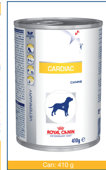
Can: 410 g