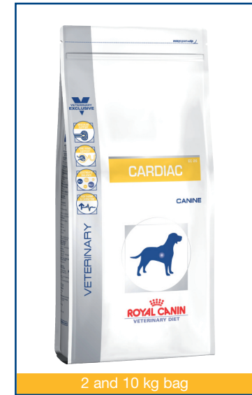
2 and 10 kg bag