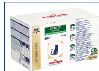
Box: 14 X 20 g sachets