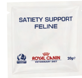
20 g sachet

** Energy measured by Royal Canin Centre