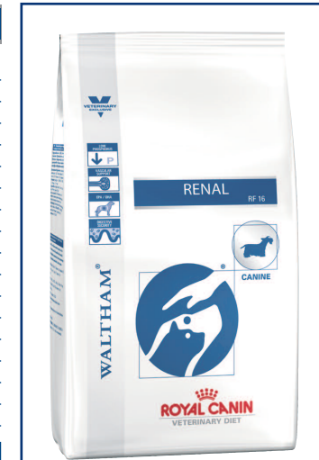
2, 7 and 14kg bag